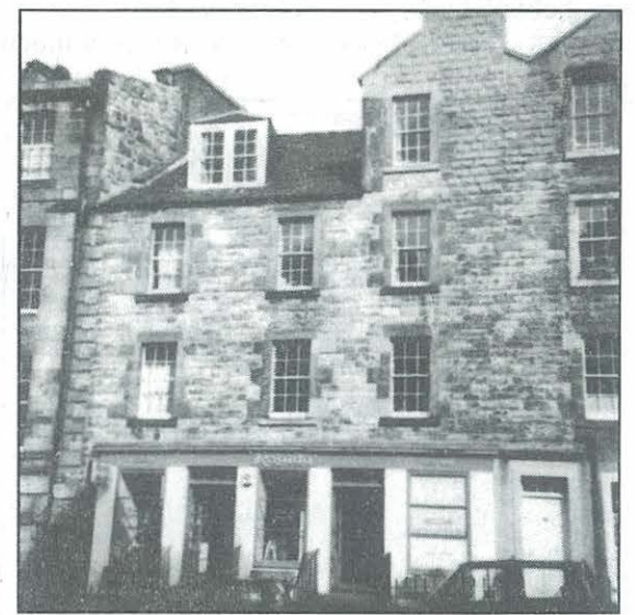
Oldest block in the street, part of the 18th century Gayfield Estate, and now home to a local meeting place- see page 3

There are different opinions about Council traffic measures, for example Greenways. And when it comes to local