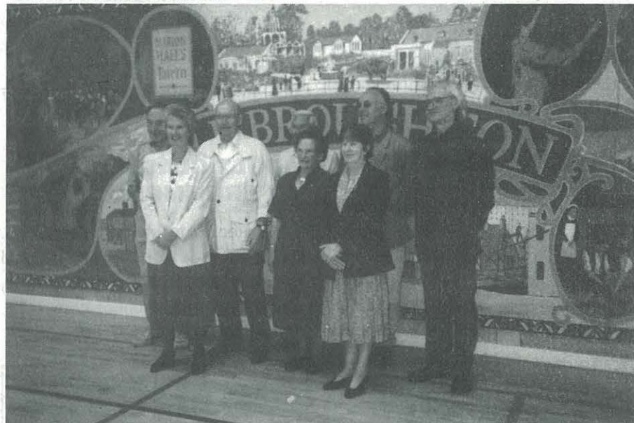
Broughton Mural Group