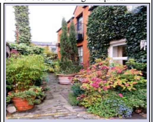
One of the joys of meandering in Edinburgh is chancing upon sylvan scenes reminiscent of Provence or paintings by Cézanne or Bonnard. This glorious concoction is the work of an inspired resident in Nelson Place. Even the ivy-clad telegraph pole is a thing of art.