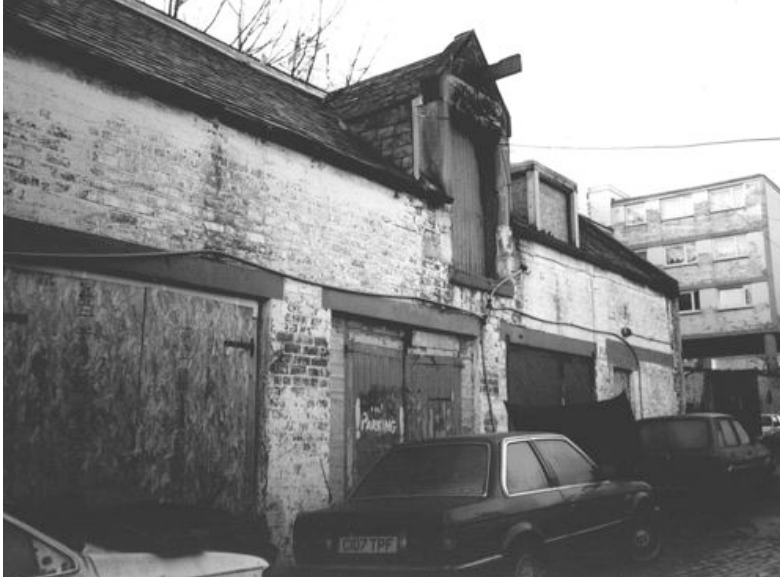
A photo from our Broughton 2000 Archive . Can you place the view?

Dickie and Martin Lauder. We've used some of the photos in our exhibitions, alongside old photos and drawings – to compare past and present. In the long-term the archive will be a valuable resource for those of future generations who have an interest in Broughton's history.