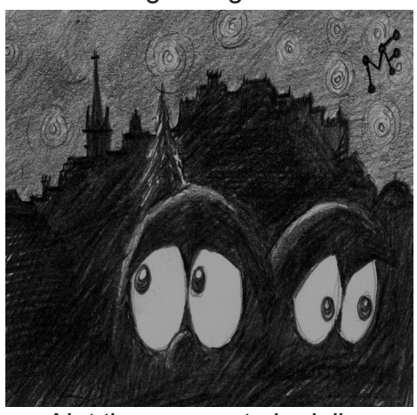
Not the season to be jolly