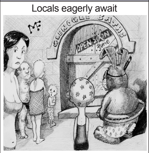
New, blush-free changing facilities

Work on the overhaul of Glenogle Baths is on schedule, says a CEC spokesperson, with a grand re-opening expected in June after a month of snagging. Visit [www.saveglenoglebaths.com] for pictures, including one of the new ogle-proof cubicle doors (Issue 165).