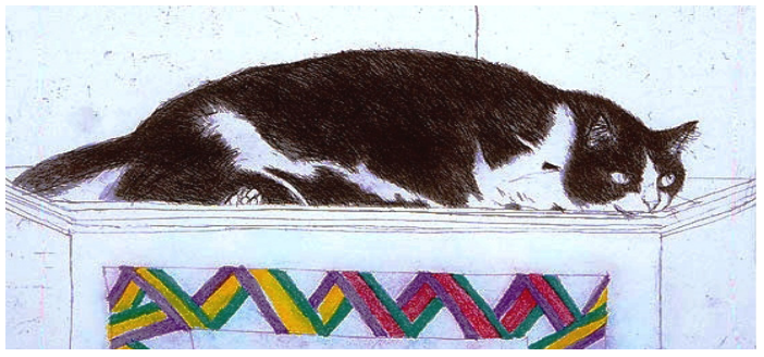
Elizabeth Blackadder, Fred on Top of the Cupboard, etching.

'The cat went here and there ... Alone, important and wise ...'