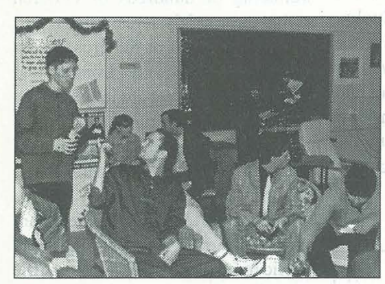
Christmas party at the Stafford Centre

At a meeting on 21st January attended that mental health community services by members of the Edinburgh and Lothian Mental Health Forum and invited representatives from the Social Work Department, the decision on how the Department intends service users, their families - and