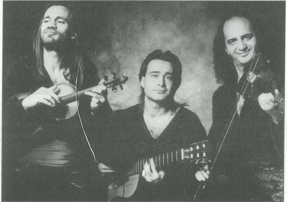
Loyko - the Russian Gypsy Band appearing at Graffiti