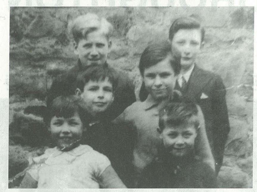
Broughton Court children