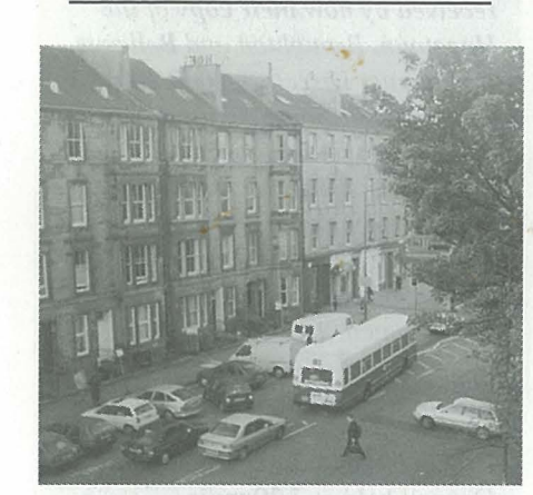
Bad parking in Broughton!

anew after many months of responsible feel no more inclined disruption and in spite of the new to stop. Along at St Mary's markings, double parking is Primary, especially during causing obstruction with delivery of pupils at morning rushemergency vehicles forced to use hour on this busy road and again sirens when trying to pass. The at collection, drivers still abuse Authorities seem unclear as yet the stopping regulations - despite whose responsibility it is to take the promotion of the "Safer Routes this one on. At the new Barratt to School" campaign. Up the road development at Rosebank, 240 of around St Mary's Cathedral, cars the intended parking spaces will be accessed from Pilrig Gardens, not a happy prospect for those the problem but - which authority? already living there. Up in East London Street, the cars parked around Europear still obstruct the on pavements, the police. Of footway and - despite advice from the Police, Procurator Fiscal, Trading Standards and the City