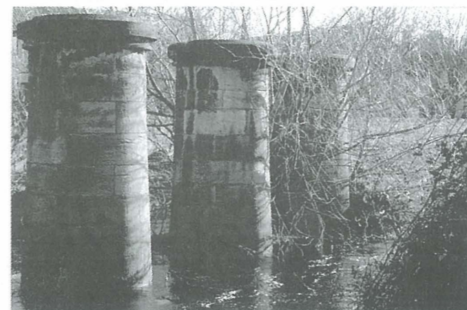
David Leslie is exhibiting a series of 15 photographs, each showing a bridge or crossing over the Water of Leith, is on view at Broughton Books in Broughton Place. One has already become an historic photograph: it shows three massive stone pillars which once supported a railway bridge near Bonnington Mills. They were recently removed after the severe flooding in that area.

But as we go to press they've managed to do the lines at one of the crossing points.