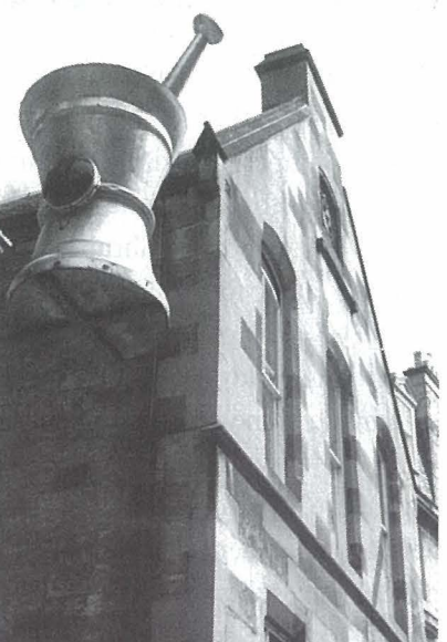
The Stafford Centre, 103 Broughton Street

Recently there's been a fair bit of heart-searching over its role: according to a circular sent out by the ManicDepression Fellowship, at one stage "the consensus was that in its present form it offered very little practical help". But now an independent review of the Centre has been completed: we are hoping that the results will be available in time for next month's