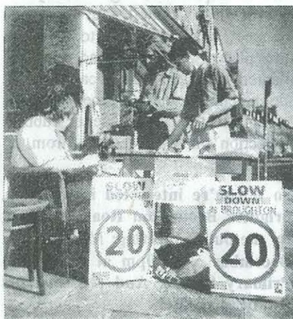
Campaigners in Broughton Street, 1995, calling for a 20mph speed limit

Back in 1994, a group of Broughton residents were already arguing the case for creating a 20mph speed limit on some of our streets. Now the City Council are committed to doing just that. It will take a while because of the lengthy legal procedures involved, but it will happen.