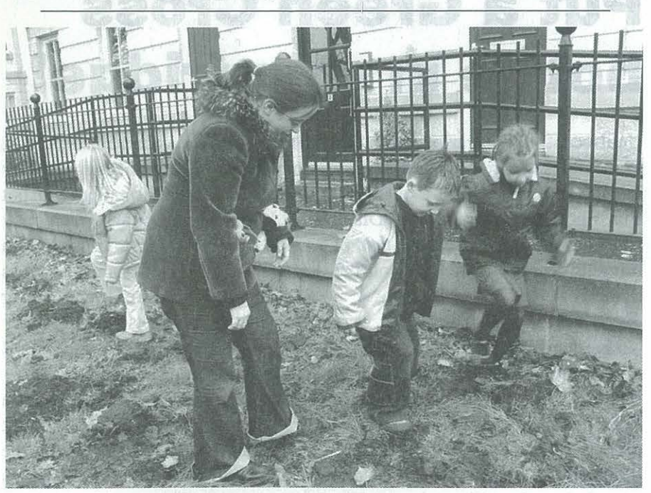
Pupils from Broughton Primary School at work in Hopetoun Crescent Garden. Along with others from Leith Walk and St Mary's, they joined the Friends of the Garden to help plant thousands of daffodil bulbs supplied by the City Council.

"A number of people said that there process, but the Council will start needed to be some road humps in