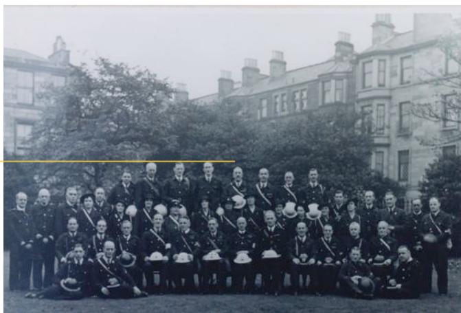
Bellevue and Claremont Division of Air Raid Wardens (tin hats on their knees) in Claremont Crescent Garden, early 1940s