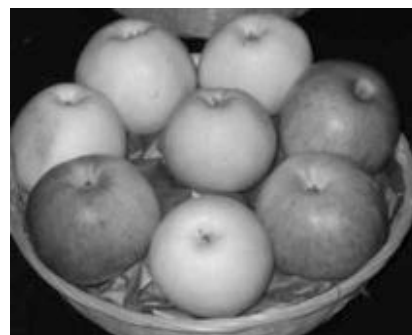
James Grieve still thrives in our cold northern gardens. The disease-resistant fruit crops well each year and produces good apple juice.