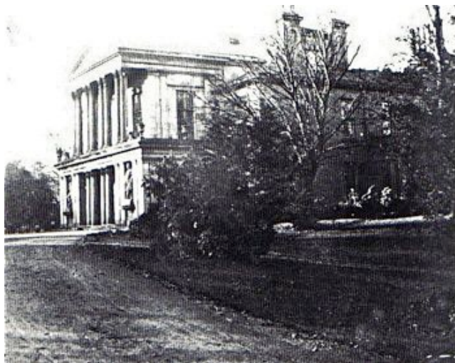
Falcon Hall (date and source unknown)

Writing in the Third Statistical Account of Scotland published in 1966, Forbes Macgregor (once the head teacher at Morningside School) described Morningside as being 'more than a geographical expression: it is a frame of mind, a social attitude, a form of speech', with 'a concentration of femininity unique in all Scotland'. Although this 'unique concentration' is drawn from 20th-century data (and cannot be independently validated because Macgregor did not confirm the data he used), my own analysis of the Morningside Census enumeration data for 1841 to 1891, and of data for both the national population and of Aberdeen, Dundee, Edinburgh and Glasgow across the same period, confirms that the proportion of females to every 100 males enumerated in Morningside across the second half of the 19th century was consistently higher.