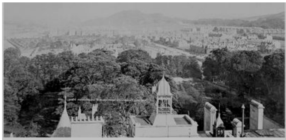
19th Century Morningside from Craighouse