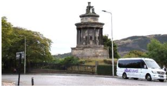
Figure 76 Regent Terrace, looking south towards the Burns Monument.