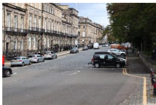
Figure 33 St Colme Street, south side, looking east

Views along St Colme Street/Albyn Place are gently sloping downwards from east to west. They are framed by the gardens to the rear of Charlotte Square on the south side,