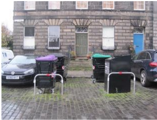
Figure 4 Example bin hub as built outside the study area in Pitt Street. This is an “in nose” (end on) parking layout’ configuration.