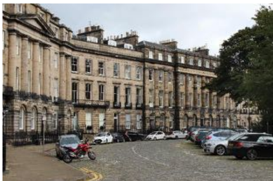
Figure 30 Moray Place, north side, looking east.