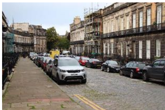
Figure 42 Danube Street, west side, looking north