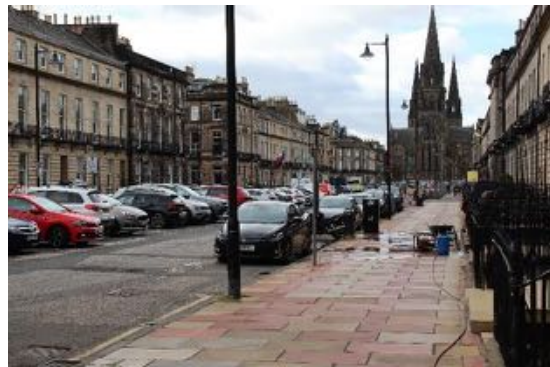
Figure 21 Melville Street, north side, looking west

The view from Queensferry Street along Melville Street towards the east end of St Mary's Episcopal Cathedral is view C15 in CEC's documentation of key views in the city centre. It is also featured in the Conservation Area Character Appraisal for the New Town conservation area as a terminated view, and the cathedral in general is identified as a focal point in the same document. The view west towards the cathedral is therefore one of the city's most important views. It is characterised by the extreme contrast between the uniformity and horizontal emphasis of the Robert Brown's early nineteenth-century terraces and the verticality and neo-gothic extravagance of George Gilbert Scott's cathedral. The former can still be appreciated in views to the west, and views in both directions also feature John Steele's statue of Viscount Melville, at the centre of Melville Crescent (Melville Street's halfway point). There is a high degree of authenticity in Melville Street, with the development surviving intact, and a sense of changing architectural tastes throughout the nineteenth century with the addition of