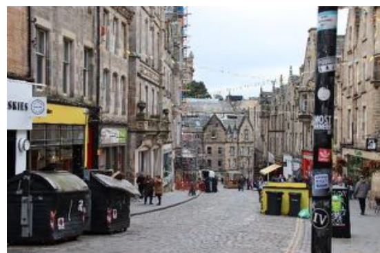
Figure 83 Cockburn Street, north side, looking east, looking west

Cockburn Street is a steep, curving street which slopes downwards from the High Street in the south to Market Street on its north side. The majority of the buildings on the