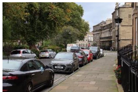
Figure 41 St Bernard's Crescent, west end, looking south

The whole of the north side and the east part of the south side of St Bernard's Crescent were designed by James Milne and built in the 1820s on land which was owned by Sir Henry Raeburn. They are designed with liberal use of the Doric order, which is characteristic of Stockbridge and of the Greek Revival period in which they were built. The particularly strong appeal of the Greek Revival in Edinburgh adds to their interest.