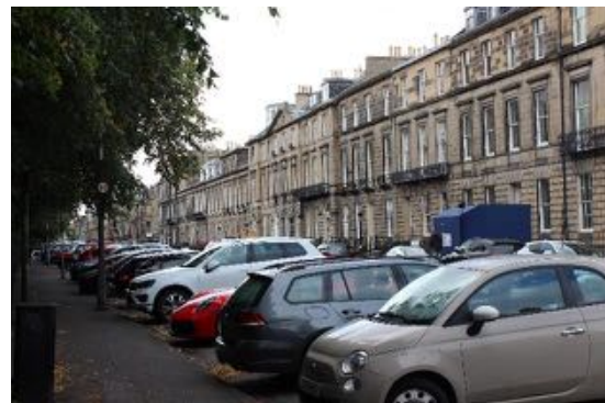
Figure 57 Heriot Row, south side, looking west