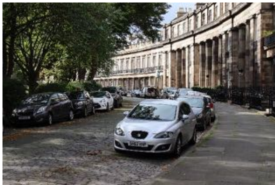
Figure 38 St Bernard's Crescent, east end, looking north