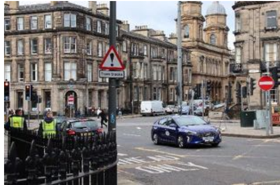
Figure 88 Torphichen Street, south side, looking west.