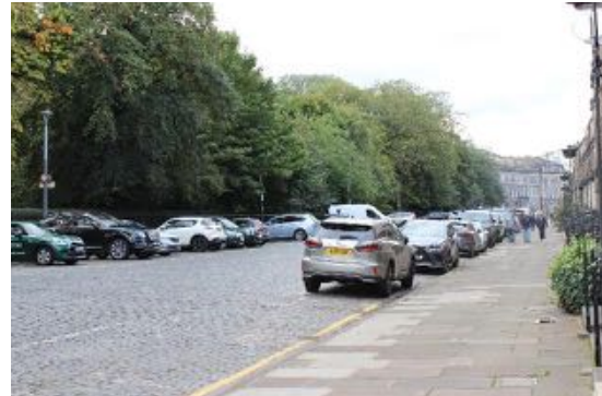
Figure 55 Heriot Row, north side, looking west