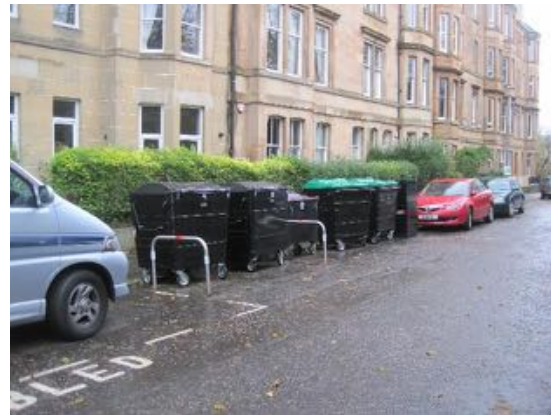
Figure 7 Example bin hub as built outside the study area in Gosford Place. Hub length appears longer than on the concept design.