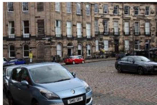
Figure 29 Ainslie Place, east side, looking south

Ainslie Place is an oval-shaped street centred on an enclosed garden. There is no pavement on the garden side. Views are dominated by James Gillespie Graham’s palace-fronted terraces, particularly notable for their rusticated entrance floors and anthemion and palmette window-guards at first-floor level. The relatively small area of the Place compared to the height of the buildings (at three storeys plus attic and basement) gives a particularly strong sense of verticality and enclosure. The streets are setted. There is a very high degree of authenticity in Ainslie Place, with very little external alteration to the buildings.