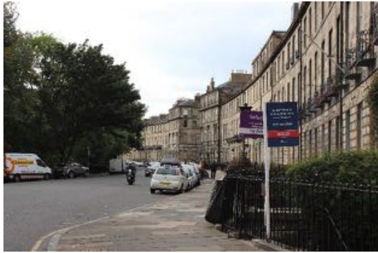
Figure 72 Abercromby Place, north side, looking west (including gull-proof bag)