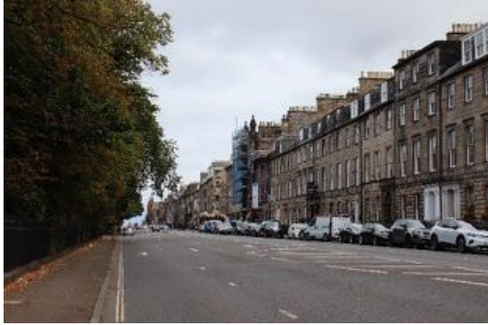
Figure 48 Queen Street, north side, looking east