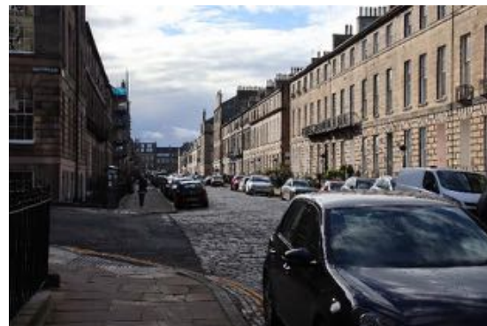
Figure 67 Northumberland Street, south side, looking west

Northumberland Street runs from east to west across the Second New Town, acting as one of two secondary thoroughfares either side of Great King Street (along with Cumberland Street to the north). The majority of the street was designed by Robert Reid and William Sibbald in the early nineteenth century, and is characteristic of New Town design with flat, uniform facades rusticated at ground floor level. Although the street was designed by Reid and Sibbald as one unified design, development in Northumberland Street was piecemeal, meaning that there is a relative lack of uniformity compared to some New Town streets; there has also been varied alteration at dormer level. However, from street level there is still a high degree of authenticity, and the road retains its original setted surface.