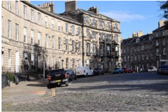
Figure 68 Drummond Place, north-east corner, looking east