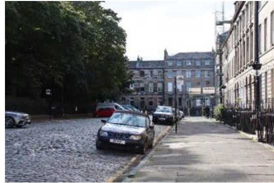
Figure 69 Drummond Place, north-east corner, looking west