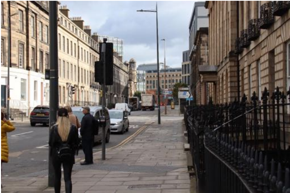
Figure 89 Torphichen Street, south side, looking east.