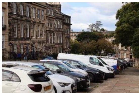
Figure 36 Glenfinlas Street, east side, looking north.