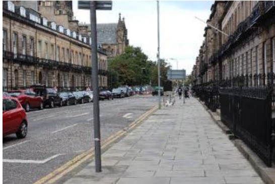
Figure 15 Manor Place, east side, looking north.