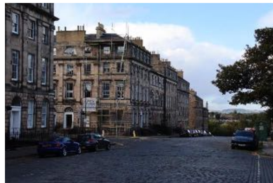
Figure 71 Drummond Place, south-west corner, looking north

Drummond Place is one of the key developments of the Second New Town, acting as its eastern terminus. It has an elongated D-shape, curved on its east end, and surrounds a central enclosed garden. Drummond Place was designed by Robert Reid and William Sibbald in 1804, with some alterations to the design by Thomas Bonnar a decade later. The topography of the site is such that the exedral east end is slightly raised. The houses comprise large, palace-fronted blocks of three storeys plus basement, and an extra storey on the pavilion and centre blocks of each part of the square. These are also enhanced with Ionic pilasters and pedimented windows. The street retains its setted surface, and the iron railings include decorative lamp-standards which are the primary street-lighting for the built-up side of the street. Street furniture has been kept to a minimum and where there have been later additions, such as the street lighting on the garden side, it has been modestly designed to complement the original design. At the centre of the west end of the street there is a listed police box by E. J. Macrae.