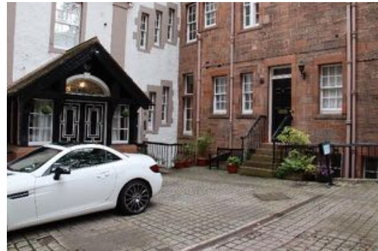
Figure 81 Ramsay Gardens, looking north-east

Ramsay Garden runs east to west, just north-east of the castle Esplanade. Views along Ramsay Garden in both directions are highly enclosed, terminated by parts of the Ramsay Garden development itself to the west, and by Ramsay Lane to the east. Buildings along the street are typically early eighteenth century in origin, but have been substantially remodelled in the late nineteenth century as part of a planned development by Professor Patrick Geddes. Some areas were also built new by Geddes. The result is a deliberately dense, vertical residential area with architectural features varied by design, including original eighteenth-century, Arts-and-Crafts, and Scots Baronial touches. Ramsay Garden is extremely characterful, and its designer intended to evoke the feeling of original Old Town spaces with small courts surrounded by vertiginous tenements. The street as it stands, however, is unique in Edinburgh and is in itself an important part of the architectural history of the Old Town.