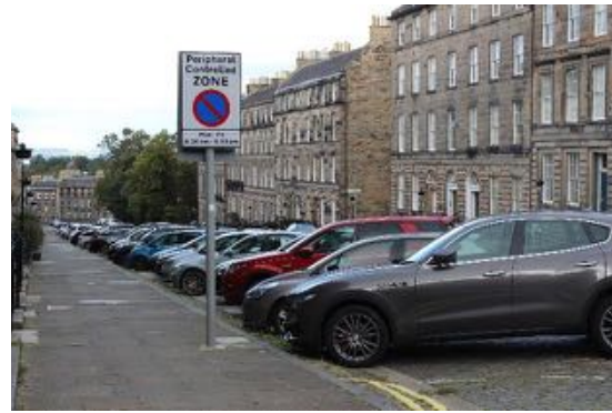
Figure 53 India Street, west side, looking north

India Street runs north-south and connects Heriot Row to Royal Circus and Gloucester Place. The street slopes downwards in a northerly direction. The majority of the terraces are by William and Lewis A. Wallace and date from the early nineteenth century, and the street is setted. Views to the north are terminated by Queen Street gardens, but the topography of the site is such that views to the south include long-distance views north across the Firth of Forth into Fife. The effect of the recession of uniform terraces (mostly mansion houses) framing these northerly views is dramatic and highly effective.