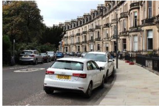
Figure 11 Eglinton Crescent, north side, looking west.

Eglinton Crescent comprises two parts, a straight west part, and a curved east part. The terraced houses in both parts are of three storeys with attic and basement; they date from the late nineteenth century and were designed by John Chesser. The houses in the curved crescent, in particular, are characterised by stacked bay windows, with curved fronts at basement and ground floor level and a canted bay above, decorated with repeated balustrading. This relatively subtle change in window design adds visual interest to the repeating façades. In the straight part of the crescent, the buildings on the north side are decorated with iron brattishing at roof level. There are views from the west end of the crescent towards Donaldson's Hospital, while views towards the southwest prominently feature the spires of St Mary's Episcopal Cathedral, which is classified as a focal point in the New Town conservation area character appraisal. The curved part of the crescent is visually complemented by Glencairn Crescent opposite, and contrasted by the central enclosed garden. There is no pavement on the garden side of the crescent.