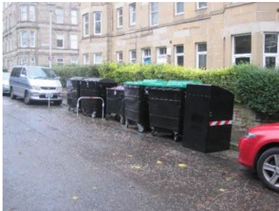
Figure 6 Example bin hub as built outside the study area in Gosford Place. This is a ‘parallel parking layout’ configuration.