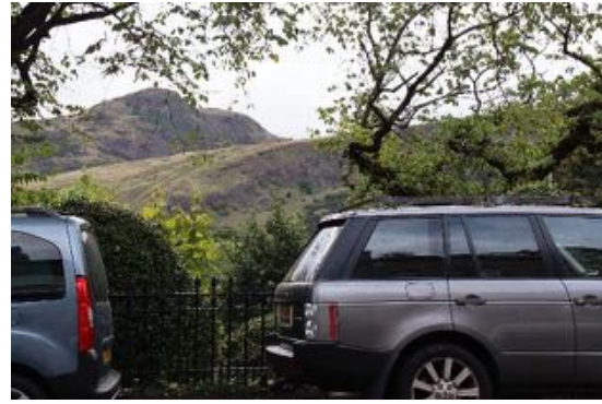
Figure 77 Regent Terrace, looking south towards Arthur Seat.

Playfair's terraces of two storeys plus basement (many with attic added later) are particularly notable for their Doric entrance porticoes, cast-iron balconies, and iron railings with decorative lamp-standards. They run only along the north side of the street, while on the south side there is a steep wooded area separating Regent Terrace from Regent Road, running parallel at the lower level. Regent Terrace is setted. Looking to the west along Regent Terrace allows a distant view towards the centre of Edinburgh, featuring the Tron Spire, while views to the east are terminated by trees on the east side of Carlton Terrace. An impressive view of Salisbury Crags is available through the trees to the south, and the Burns Monument can be viewed from the west end of the terrace. Regent Terrace is one of the most important streets in the Third New Town development and was deliberately designed with the effects of views along, towards, and away from it in mind.