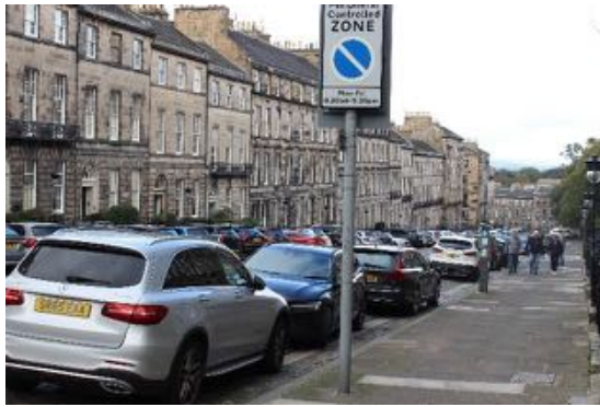
Figure 52 India Street, east side, looking north