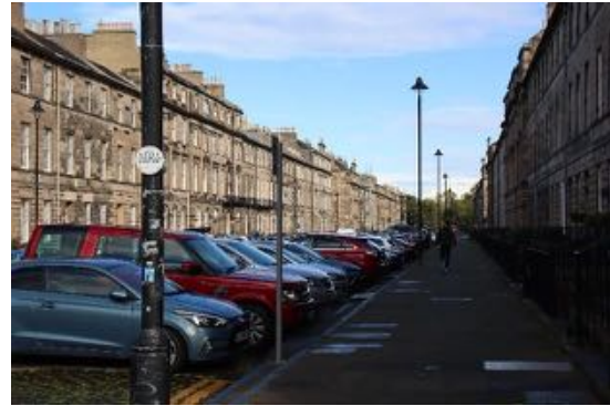
Figure 61 Great King Street, south side, looking east