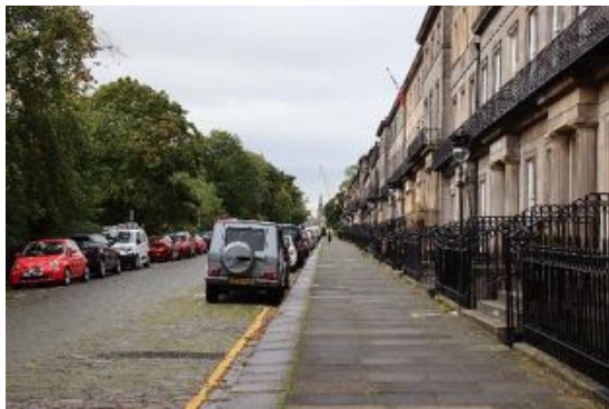
Figure 74 Regent Terrace, north side, looking west.