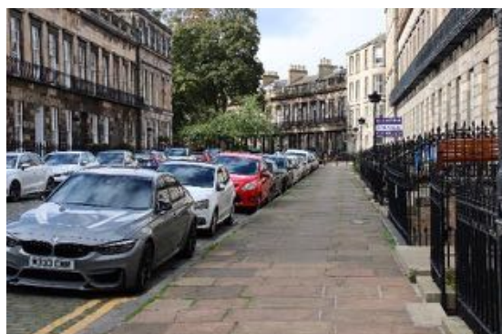
Figure 44 Carlton Street, east side, looking north