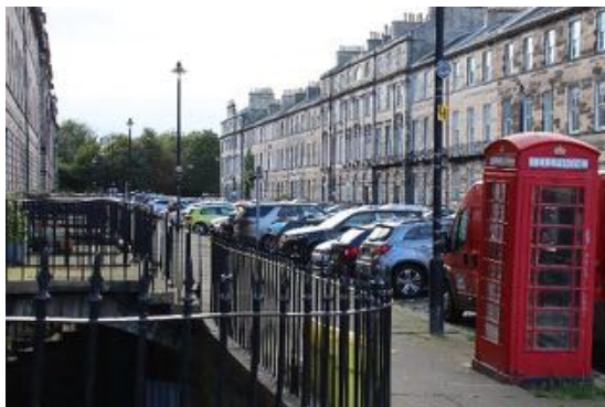
Figure 62 Great King Street, south side, looking west