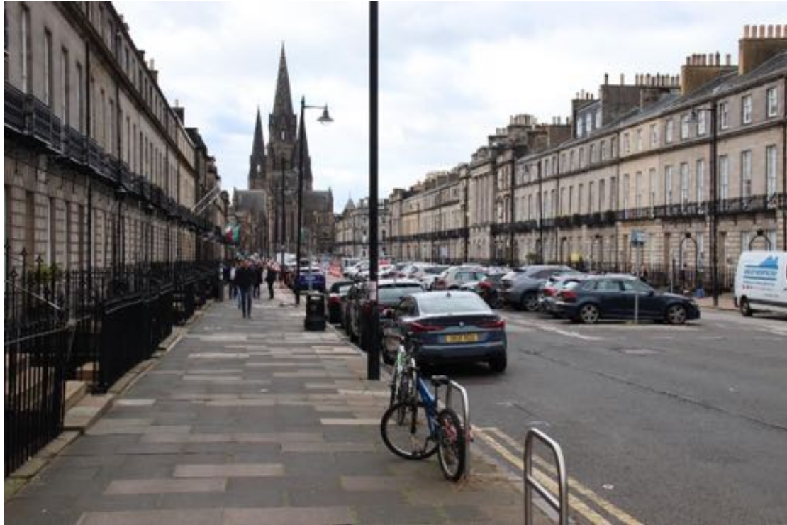
Figure 19 Melville Street, south side, looking west