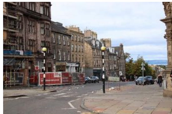
Figure 47 Frederick Street, east side, looking north

The view north along Frederick Street from the junction with George Street is designation as Key View C12, view A1. Bin hubs are proposed for the section of Frederick Street between the junctions with Thistle and Queen Streets. The view to the north is terminated by Playfair’s church of St Stephen, while the downward sloping of the street also allows for spectacular distant views towards Fife. The buildings lining Frederick Street are typically late-eighteenth century New Town tenement terraces with shopfronts added in the nineteenth century. The view north along Frederick Street is one of the more dramatic in Edinburgh (and its designation recognises it as such), but some measures have already been taken which negatively affect its appearance, in particular the proliferation of street furniture, partial and now deteriorating surfacing of its setted street paving with asphalt, and the use of on-street bins in some parts.