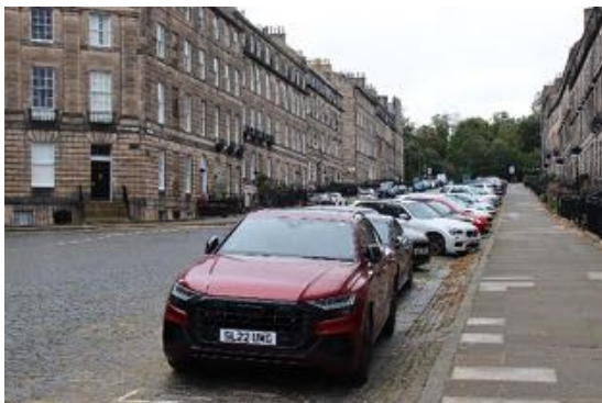
Figure 50 India Street, east side, looking south