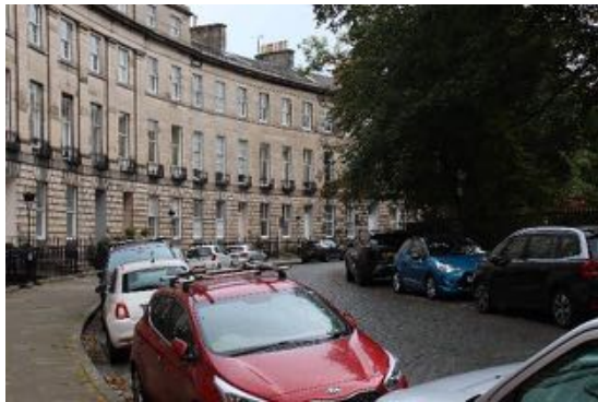
Figure 58 East end of Royal Circus looking north-west.