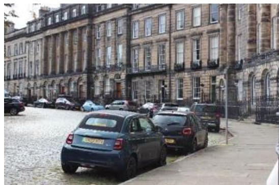
Figure 31 Moray Place, north side, looking west.

Moray Place is the centrepiece of the Moray Estate development, its highest-status address and most elaborately designed street. It is a circular street surrounding the central Moray Place Bank Gardens. The terraces, by James Gillespie Graham, are made up of palace-fronted blocks, the central blocks with tetrastyle porticoes of engaged Tuscan columns with a blank entablature and triangular pediment above. The houses are finished with ironwork including anthemion and palmette window-guards at first-floor level and decorative lamp standards which are the main source of lighting on the built-up side of the street. There are modern streetlights on the garden side, although there has been some effort (only partially successful) to choose a design which complements the iron lamp standards. Additional street furniture has also been kept to a minimum. Views around Moray Place are characterised by the dramatic unfolding of Gillespie Graham's buildings as the viewer moves around the square, which is enhanced by the sloping of the street, which is highest at its south-east corner. The street is setted. Although there have been some minor alterations to the buildings at attic level, Moray Place generally has a very high degree of authenticity and has changed little externally since it was established as the jewel in the crown of the Moray Estate.