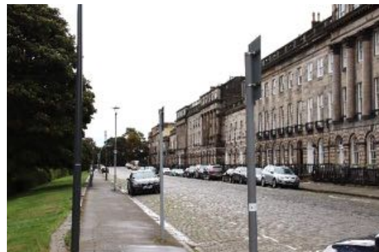
Figure 79 Royal Terrace, north side, looking east

Edinburgh Key View C07c is along Royal Terrace, towards Greenside Church to the east. Royal Terrace runs along the north side of Calton Hill, and is part of the Third or Eastern New Town development of W. H. Playfair in the 1820s and 30s. The wide, setted street is lined with Playfair's terraces on the south side, and the downward-sloping London Road Gardens on the north side, which separate Royal Terrace from the parallel London Road. Playfair's palace-fronted blocks are worked around a system of seven pavilions: four Ionic hexastyle flanking pavilions, two composite heptastyle pavilions, and a central decastyle composite pavilion. Additionally the