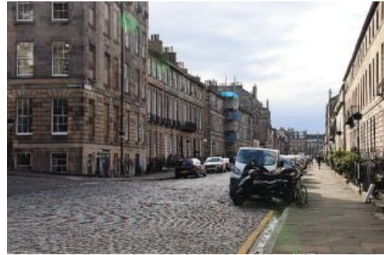
Figure 65 Northumberland Street, north side, looking west