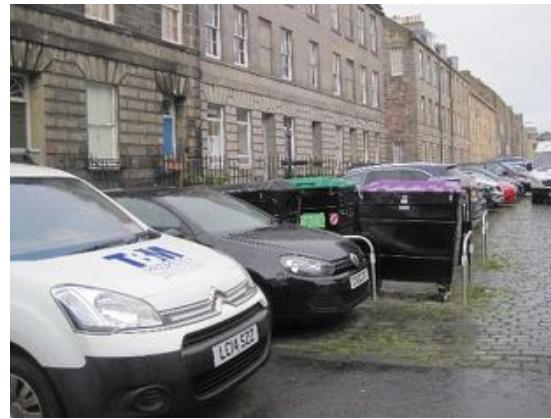
Figure 5 Example bin hub as built outside the study area in Pitt Street, showing hub extending beyond most parked cars.