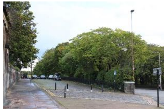
Figure 75 Regent Terrace (west end of the street), north side, looking east.

Two views from Regent Terrace are designated as Key Views: the view west towards the Tron Spire (view C07a) and south towards Salisbury Crags (view C07b). Impressive views are available along the street in both directions, however. Regent Terrace runs along the south and east side of Calton Hill, and was developed as part of the Third, or Eastern New Town by Playfair in the 1820s and 30s.