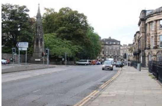
Figure 32 Albyn Place, north side, looking west