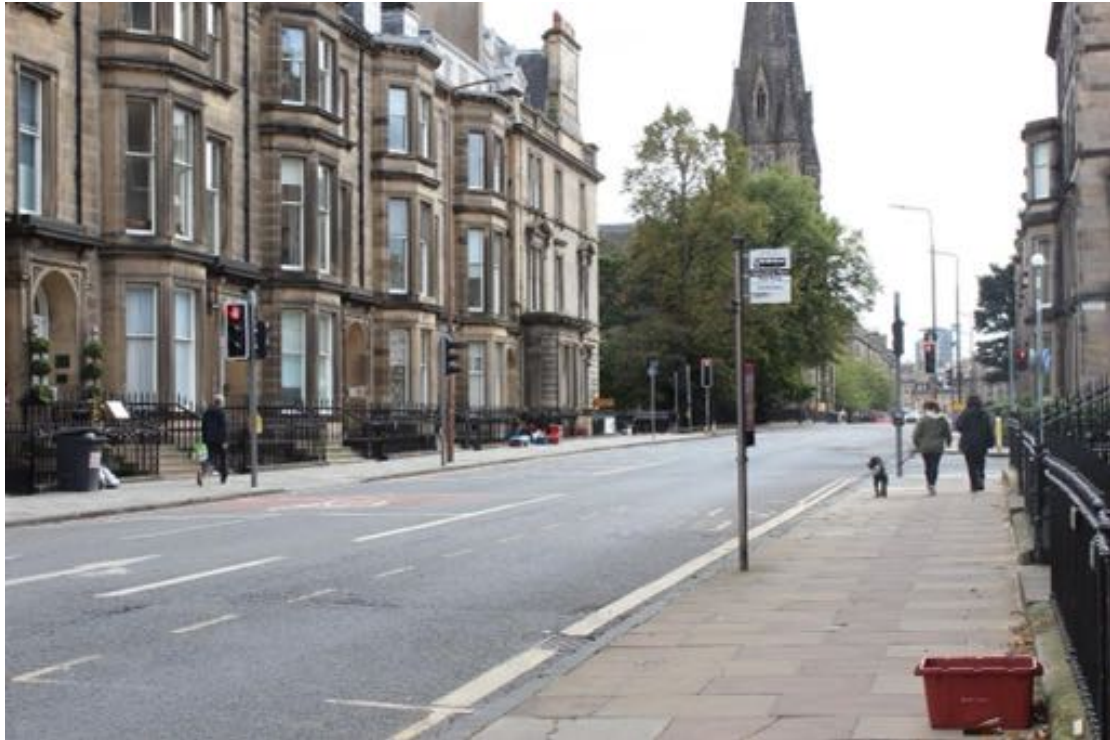
Figure 14 Palmerston Place, west side, looking south.

The view north along Palmerston Place from the junction with West Maitland Street is CEC's key view C17; this view takes in George Gilbert Scott's St Mary's Episcopal Cathedral, which is identified as a focal point in the New Town Conservation Area Character Appraisal. Palmerston Place currently has mixed bin provision: the south end is served by some on-street bins, while the north end is served by gull-proof bags.