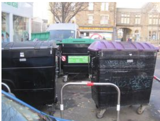
Figure 8 Example bin hub as built outside the study area in Smith Place. This is an “in nose” (end on) parking layout’ configuration. A larger gap can be seen between bins than shown on concept design.