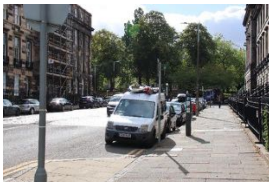
Figure 25 Great Stuart Street, west side, looking south