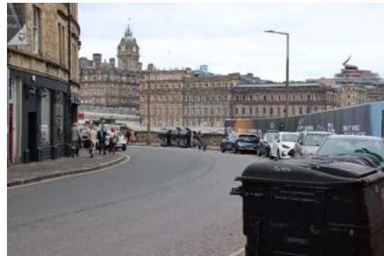
Figure 85 Jeffrey Street, north side, looking west