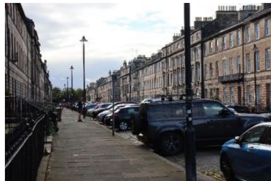
Figure 63 Great King Street, south side, looking west

Great King Street runs east-west between Royal Circus and Drummond Place and was conceived as the central throughfare of the Second New Town. It was designed by Robert Reid and William Sibbald c.1810, and construction began in 1814. It is made up of four palace-front blocks, the street bisected centrally by Dundas Street. As befits its status, the palace-fronts are especially grand, with Ionic pilasters on the central and end raised blocks, and pedimented windows at first floor level in the central and end bays of each block. The street is setted, and also retains its original stone gullies and mounting blocks. The views in both directions are towards the central enclosed gardens of Royal Circus and Drummond Place, and in the latter direction includes a listed police box, designed by E. J. Macrae. The most important feature of the views, however, are their framing by the uniform fronts of Reid and Sibbald's buildings; the status of the street makes this one of the most important views in the Second New Town. Great King Street has a very high degree of authenticity, as the exterior of the buildings remains largely unchanged since their construction, and the street retains its ironwork and historic road surface and other furniture. Later additions, such as the freestanding street lights, have been modestly and relatively tastefully designed to complement the street, and other street furniture is minimal.