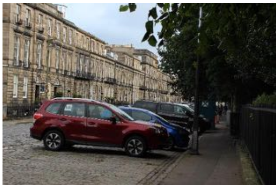
Figure 56 Heriot Row, south side, looking east