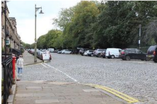
Figure 54 Heriot Row, north side, looking east