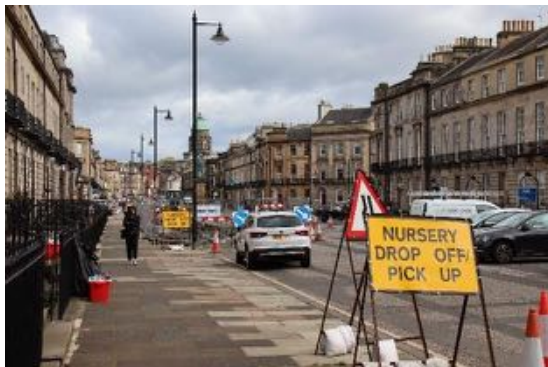
Figure 20 Melville Street, north side, looking east