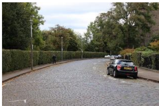
Figure 34 Doone Terrace, west side, looking north-east