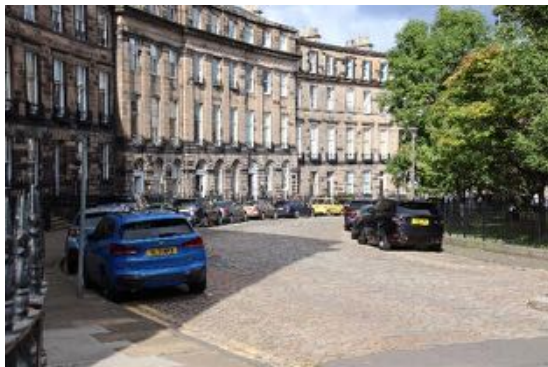
Figure 26 Ainslie Place, south side, looking west