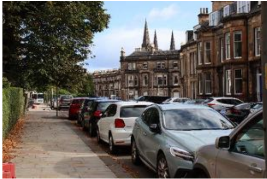
Figure 10 Eglinton Crescent, north side, looking east.