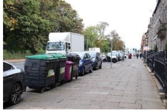
Figure 49 Queen Street, south side, looking east

The view east along Queen Street from the junction of Queen and North Castle Streets is designated as Key View C11a. Bin hubs are proposed on Queen Street from this point to the junction with Hanover Street. Queen Street Gardens runs along the north side of Queen Street, while the south side is made up of generally late-eighteenth-century terraced housing which was part of the First New Town development. Viewed from the junction with North Castle Street, the view is characterised by the contrast between the regular terraces and the thick vegetation of the gardens; the view is to open sky to the east, due to the downward sloping of York Place towards Picardy Place. Features of the view include the Tudor turrets of John Henderson’s 1852 Queen Street Church, and more distantly the Scottish National Portrait Gallery by Robert Rowand Anderson. The view is also notable for its dimensions: the sheer length and width of the street makes an impression, and historically would have made a dramatic contrast with the cramped conditions of the Old Town.