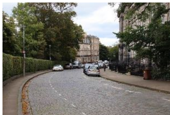
Figure 35 Doone Terrace, north side, looking east towards Gloucester Place

Doone Terrace is a long, curving street which becomes Gloucester Place, connecting Moray Place with India Street. The topography of the site, which slopes dramatically downwards on the north side of the terrace, means that there are houses on only one side of the street; these are made up of a palace-fronted block by James Gillespie Graham typical of the Moray Estate. On the other side of the street, a hedge separates the road from Moray Bank Gardens; the view is in part defined by its relationship by the contrast between the built-up south and open north side. The street also slopes slightly downwards from west to east. The result is a dramatically curved street, with Gillespie Graham’s building gradually revealed as the viewer moves eastwards. Distant views are along Gloucester Place, where there are terraces by Thomas Bonnar. These are more severe than Gillespie Graham’s, and are characterised by banded rustication at ground floor level.