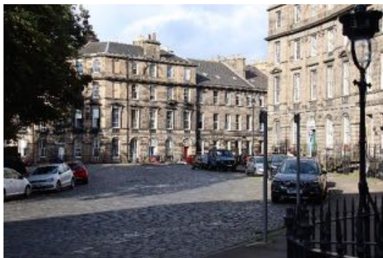
Figure 70 Drummond Place, south-east corner, looking east