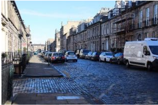
Figure 64 Northumberland Street, north side, looking east