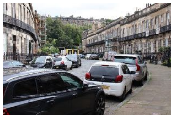
Figure 43 Danube Street, west side, looking south

Danube Street is a gently curving street running south from St Bernard's Crescent towards Dean Terrace. Views north along the street are towards St Bernard's Crescent, in particular its central enclosed garden, while views south are towards the Water of Leith, the wooded area around the river and, at a higher level, the rear of Moray Place. The view is framed by James Milne's 1824 terraces. At two storeys plus basement, the houses are relatively modest in size, which is characteristic of Stockbridge in comparison to the New Town. They are rusticated at ground floor level, with decorative ironwork balconies above, and the street is articulated with an advancement of six bays at the centre on each side which has a solid, rather than a balustraded, parapet. The street is setted. Danube street has a high level of authenticity, with little change since the buildings were erected.