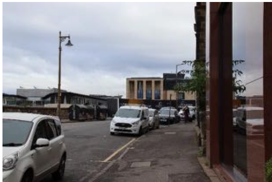
Figure 84 Jeffrey Street, south side, looking east