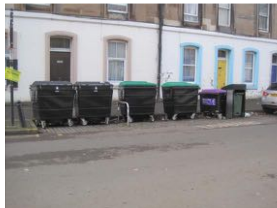
Figure 9 Example bin hub as built outside the study area in Dalmeny Street. This is a ‘parallel parking layout’ configuration. Hub length appears longer than on the concept design.

It should be noted that a ‘Gulley Safeguard area’ is shown in the concept design for locating hubs ‘against parks and gardens’ but not in the “in nose” (end on) parking