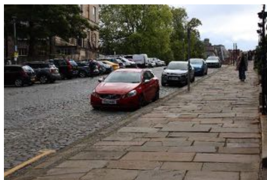
Figure 37 Glenfinlas Street, west side, looking south.