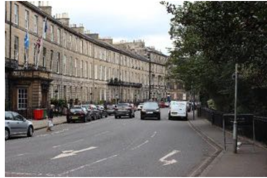
Figure 73 Abercromby Place, south side, looking east

Abercromby Place is a slightly curved street. It runs east-west and is bordered by a large private garden to the south. The north side of the street consists of two fairly identical terraces by Robert Reid and William Sibbald (1806-19) with later additions including a porch by David Bryce at number 30 (The Royal Scots Club). Each terrace is of 44 bays and three to four storeys in ashlar sandstone over a rock-faced rusticated basement. The street retains its iron railings including decorative lamp-standards.