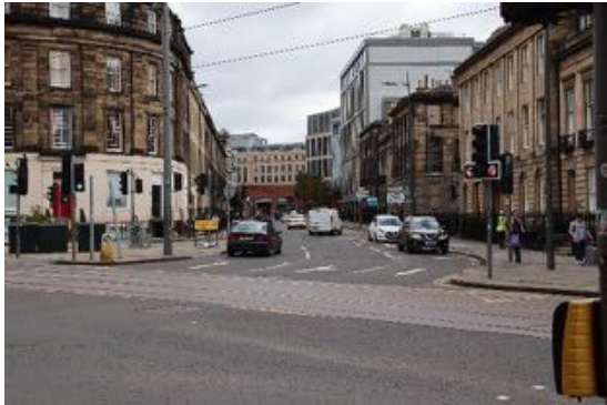
Figure 87 Torphichen Street, looking east.