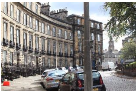
Figure 22 Randolph Crescent, east side, looking south-west.