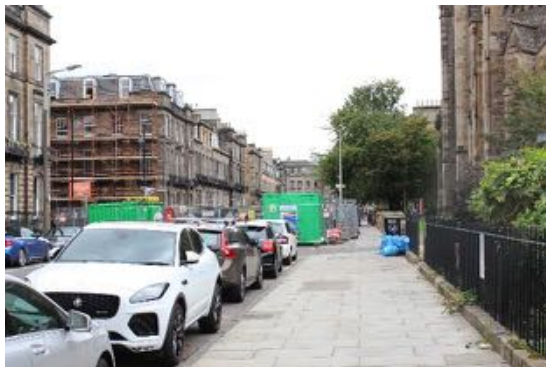
Figure 17 Manor Place, west side, looking south.