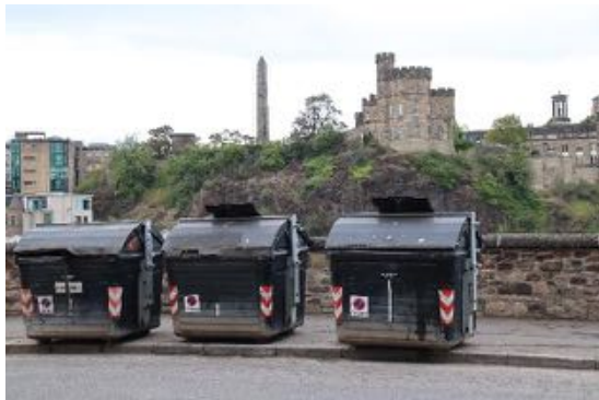
Figure 86 Jeffrey Street, south side, looking north towards Calton Hill