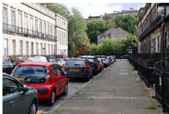
Figure 45 Carlton Street, west side, looking south