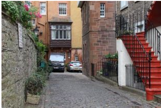
Figure 80 Ramsay Gardens, looking west