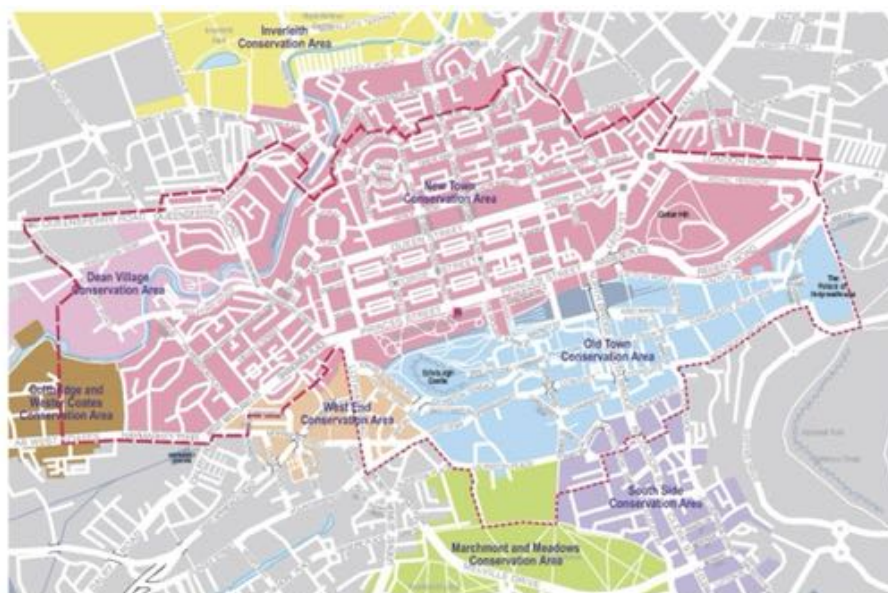
Figure 1 Heritage assets: the interaction between the WHS and City of Edinburgh Council's conservation areas. The outline of the WHS is marked in red. The individual conservation areas are shaded. ©UNESCO

The study area comprises the Old and New Towns of Edinburgh World Heritage Site ( Figure 1 ) as well as the New Town, Old Town, and West End conservation areas.