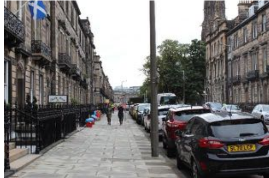
Figure 16 Manor Place, east side, looking south.