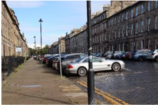
Figure 60 Great King Street, north side, looking east