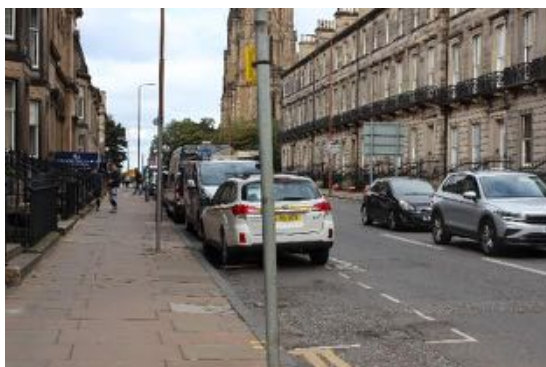
Figure 12 Palmerston Place, west side, corner of West Maitland Street, looking north.