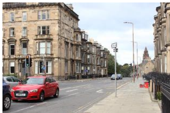
Figure 13 Palmerston Place, east side, looking north.