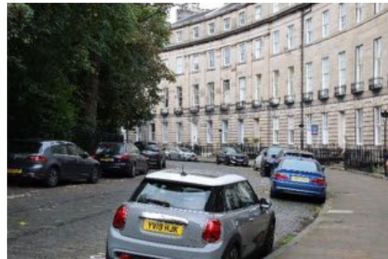
Figure 59 West end of Royal Circus looking north-east.

Royal Circus is the western terminal feature of the Second New Town (Drummond Place being the eastern feature) and it was designed by W. H. Playfair in 1820. The buildings on the north side of Royal Circus form a crescent around a central enclosed garden. There is no pavement on the garden side. It is palace-fronted, the central and end blocks defined by an extra storey in height (four storeys plus basement, while the linking blocks have three) and Tuscan pilasters. The façade is further articulated with iron window-guards at first floor level and rustication on the ground floor. The screening effect of the central garden means that the buildings are gradually revealed as the viewer moves around the Circus. The relatively enclosed space between the garden and the buildings emphasises their height and gives them a sheer, cliff-like appearance. The street is setted.