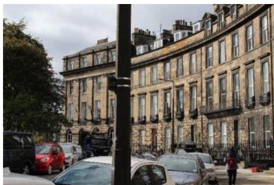
Figure 23 Randolph Crescent, east side, looking north-west.

Randolph Crescent is a semi-circular crescent along one side of an enclosed central garden. All views around Randolph Crescent have the gardens on one side. There is only a minimal pavement on the garden side. Views are dominated by James Gillespie Graham's 1822 terraced houses in two blocks, one on either side of the junction with Great Stuart Street. Each block is terminated at both ends by a pavilion of four bays, highlighted by a stepping-forward of the façade and use of Tuscan pilasters between the bays. The road surface is setted. The view around Randolph Crescent is characterised by the contrast between the high terraces and the central garden, and by the revealing of uniform houses as the viewer moves around the crescent. Near the centre of the crescent, views also feature the listed early twentieth century lamp standard by E. J. MacRae.