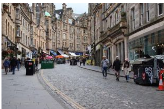
Figure 82 Cockburn Street, north side, looking east