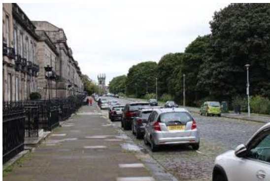
Figure 78 Royal Terrace, south side, looking west.