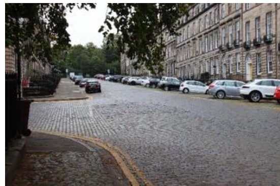
Figure 51 India Street, west side, looking south