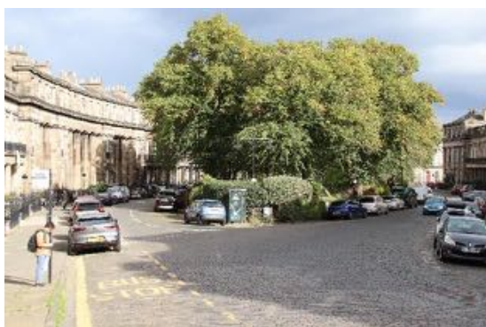
Figure 40 St Bernard's Crescent, west end, looking east