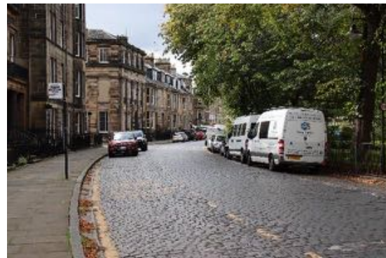
Figure 39 St Bernard's Crescent, east end, looking south