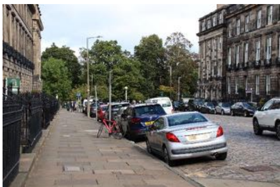
Figure 24 Great Stuart Street, west side, looking north