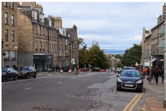
Figure 46 Frederick Street, east side, looking north