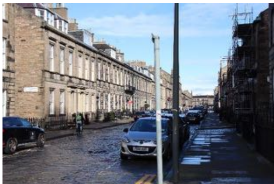
Figure 66 Northumberland Street, south side, looking east