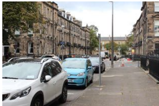
Figure 18 Manor Place, east side, looking north.

Views along Manor Place are dominated by George Gilbert Scott's Episcopal Cathedral, in particular the east end, which faces on to Manor Place, and the crossing tower. At the south end of the street, views are framed by 1820s terraced houses by Robert Brown. They are typically of two storeys plus basement, with a third storey on the end pavilions, which are also highlighted with extra architectural details such as pedimented central windows, and prominent cornice. At the north end of Manor Place the terraces are later, by John Lessels, but mimic some aspects of Brown's design such as rustication at ground floor level, and a relatively flat façade where generally by the later nineteenth century bay windows would have been preferred. This deliberate emulation of the earlier design gives views along manor place a stronger sense of uniformity. At the centre of Manor Place the cathedral is especially prominent, emphasised by the gardens around it. Page\Park's West End Medical Practice is low-lying, an example of contemporary development which aims not to detract from its historic surroundings.