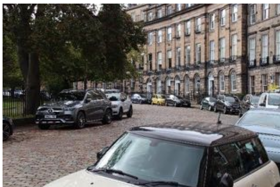
Figure 28 Ainslie Place, north side, looking west