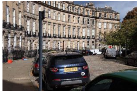
Figure 27 Ainslie Place, west side, looking north