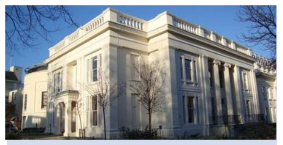
RHSPT: Impact Assessment