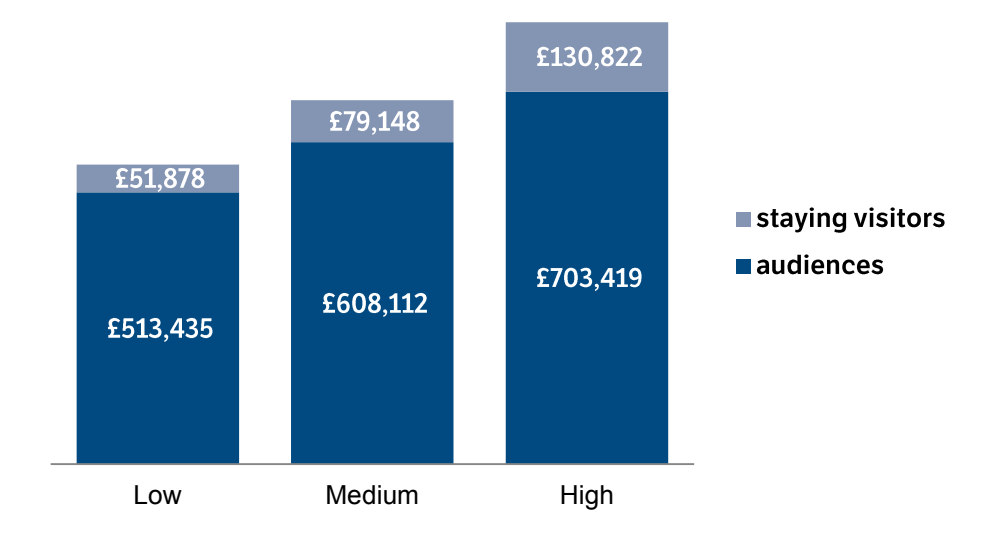
Figure 11: Net economic impact of spending by visitors per annum

This could increase through events programming. The potential for additional visitors through outdoor events utilising the garden is considerable. Programming here has not yet been developed, but would be a key potential economic impact worth investigating as proposals are developed.