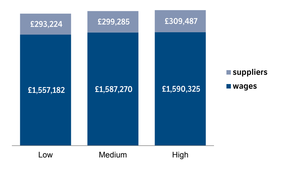
Figure 8: Net economic impact of spending on wages and suppliers per annum

The combined operational spending by SMMS at the RHS is shown below: